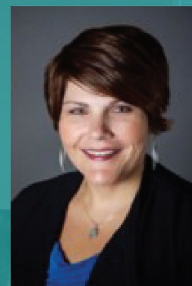
THREASE HARMS CITY COUNCIL