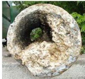
Fats, Oils & Grease