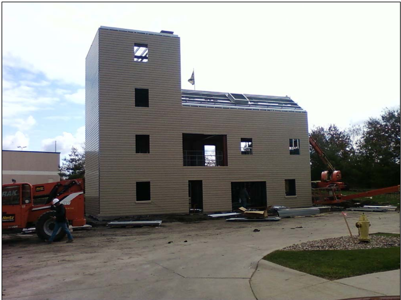
Combined Training Facility with exterior siding in place