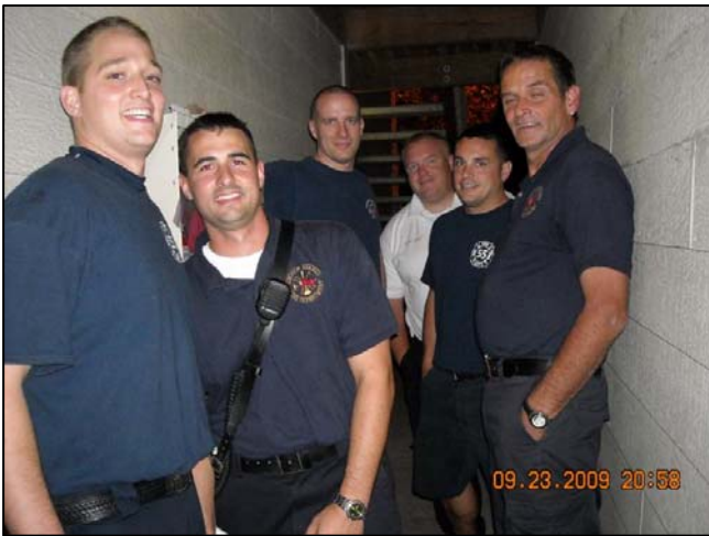
Chief and members at a local apartment complex discussing building construction and tactics.