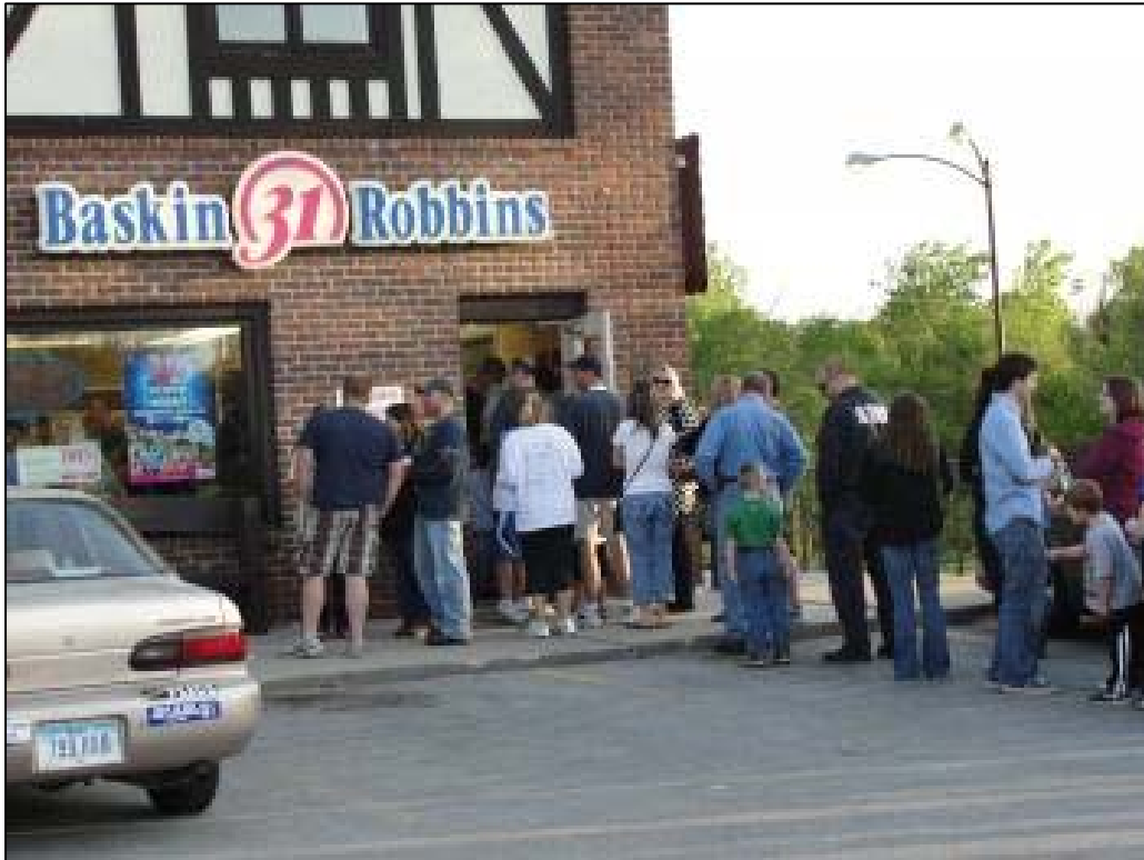
Baskin Robbins 31 Cent Scoop Night