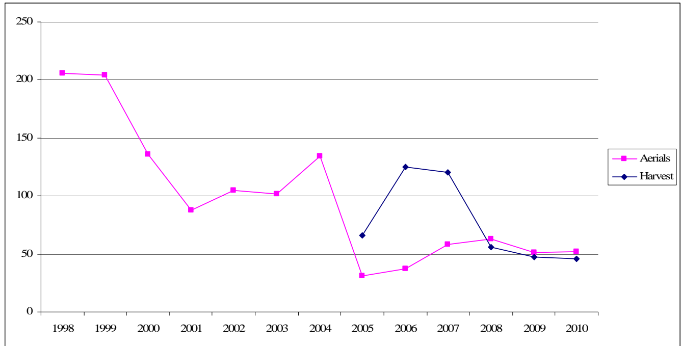
Figure 1. The number of deer observed at Water Works Park (y-axis), from the helicopter survey, 1996 – present.